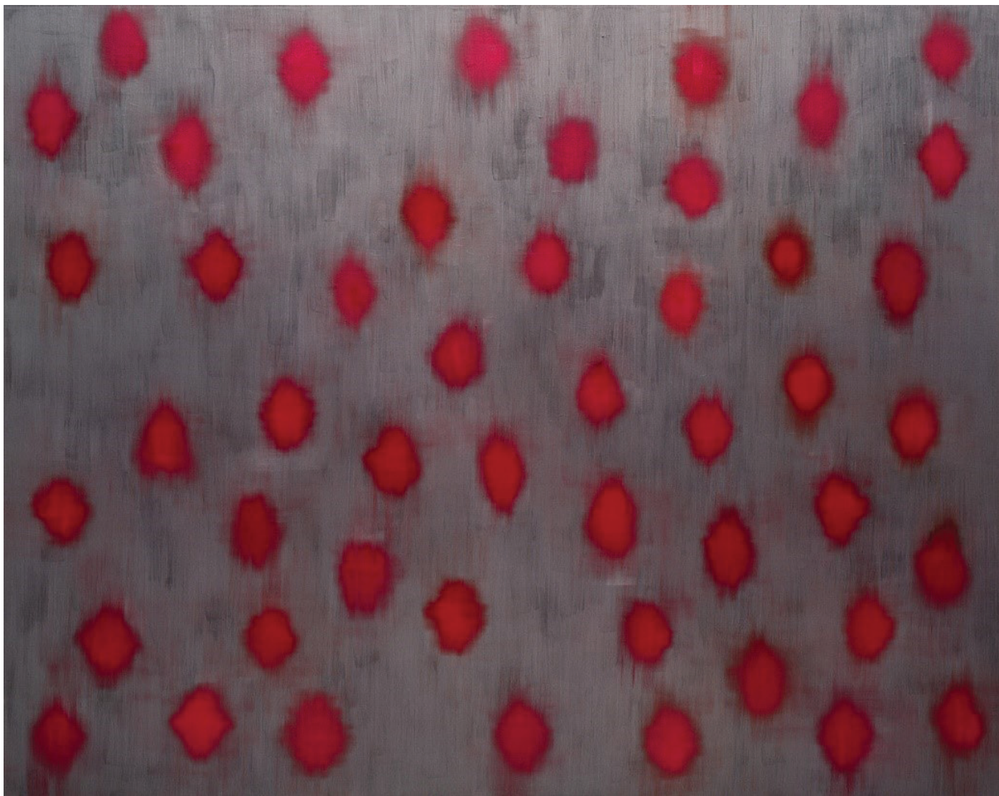
Throbbing Hearts, 1994 Olje na platnu, 244.2 x 305.4 cm