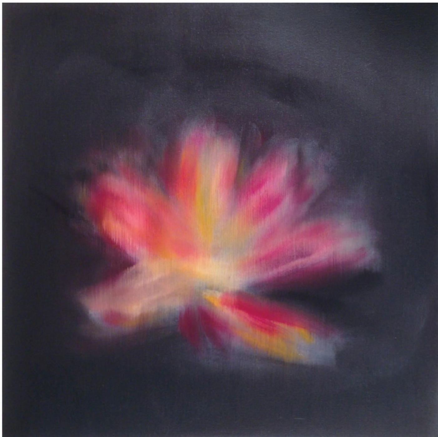
Black Monet, 2014 Olje na platnu 45.7 × 45.7 cm