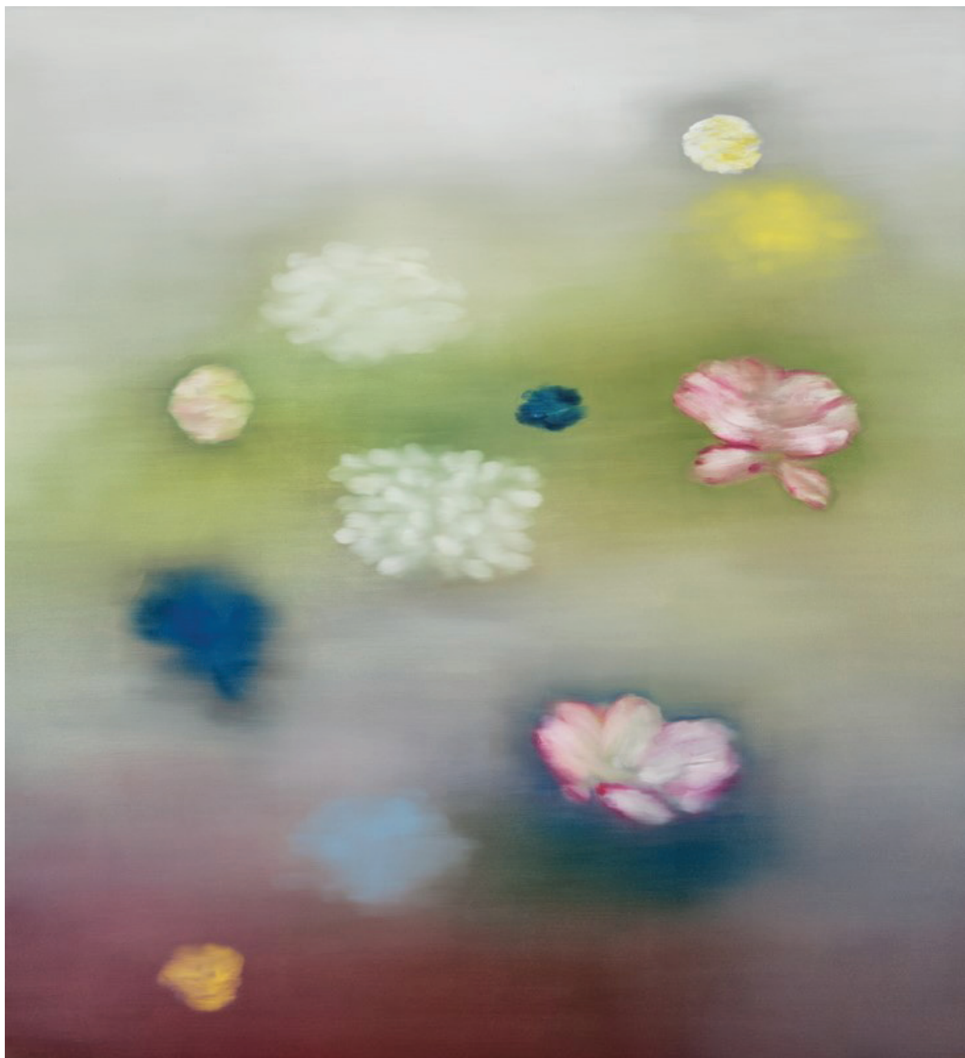
Untitled (Water Lilies), 2018 Olje na platnu, 182,9 × 167,6 cm